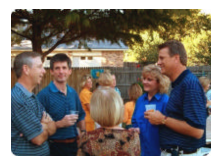
The Blue Shirt Club