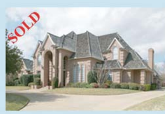
2904 Meadowview Dr.—Brook Meadows Colleyville—$489,900 4BR, 4.1BA, Pool & Spa, 2 Liv.areas