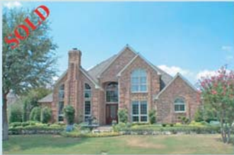
4604 Green Oaks Dr.—Brook Meadows Colleyville—$549,000 4BR, 4 Baths, 2 Living, Pool & Spa