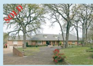
3000 Sherwood.—Brighton Oaks Colleyville—$1,085,000 5BR, 5 Full BA, Game & Media Room