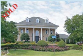
4401 Shadycreek Lane.—Brook Meadows Colleyville—$509,500 4BR, 3.1 Baths, 4 Car, Pool & Spa