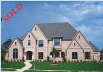
6100 Mustang Trail.—Remington Park Colleyville—$875,000 5BR, 5.1 Baths, 4 Living