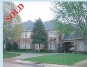
4419 Meandering Way.—Thornbury Colleyville—$1,235,000 4BR, 4.2 Baths, 3 Car, Game Rm, Media