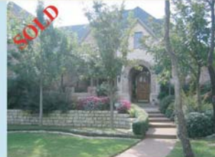
2617 Independence.—Heritage Colony Colleyville—$749,500 5BR, 5.1 Baths, 4 Living, Pool & Spa