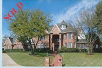
2500 Valley Ridge.—Thornbury Colleyville—$699,000 4BR, 3.1 Baths, 3 Living, Pool & Spa