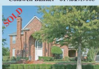
4700 Lakeside Dr.—Thornbury Estates Colleyville—$656,000 5BR, 4.1 Baths, 3 Living, Pool & Spa