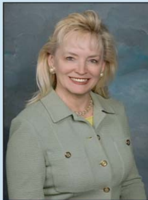
Coldwell Banker *817.329.9005