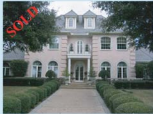
2900 Meadowview Dr.—Brook Meadows Colleyville—$539,000 4BR, 4.1 Baths, 3 Living, Media Room