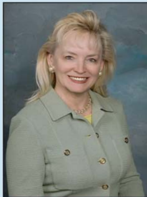
Coldwell Banker *817.329.9005